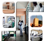
GRUPE FSE | FSE GROUP www.fse-export.com

Rue du Moniteur 9 BE-1000 BRUSSELS T +32 2 219 11 03 infobruelles@fse-export.com www.fse-export.com